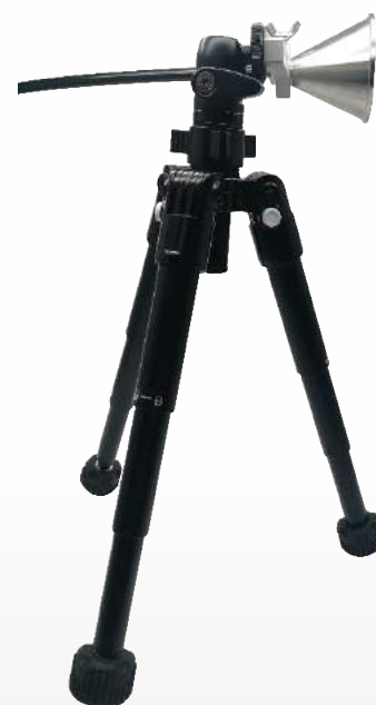
Isokinetic sampler with stand and hose