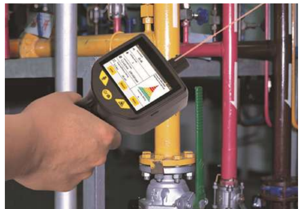
Leak detection from distance with the integrated laser pointer