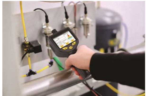
Ultrasonic Leak Detector S531