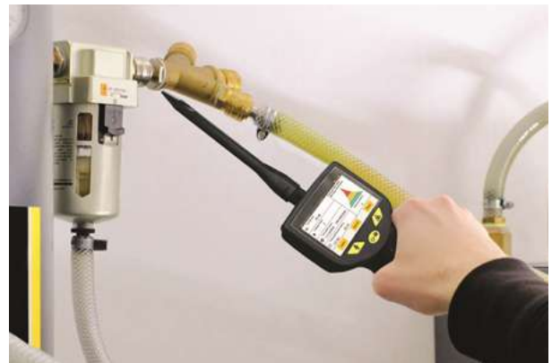
Leak detection with focus tube