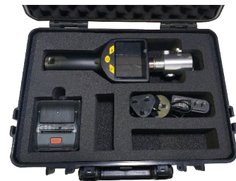
The included transport case protects the measurement instrument. At the same time it holds all accessories.