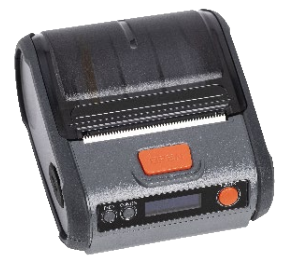
Option: wireless printer used to print the measurement results on site. Perfect solution for quick audits.